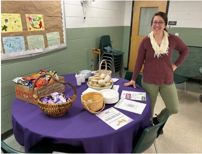
GFWC Brookline Women's Club selling snacks at their town meeting