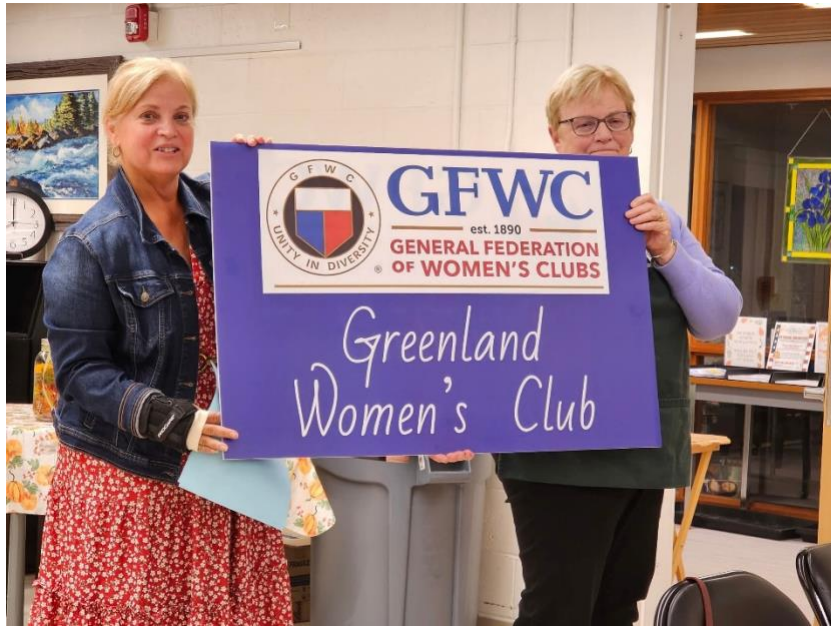
GFWC Greenland Woman's Club used GFWC – NH mini grant for a yard sign