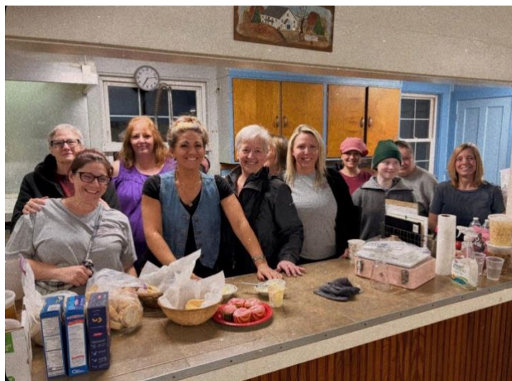
GFWC Candia Community Woman's Club very successful and delicious Annual Loaf and Ladle