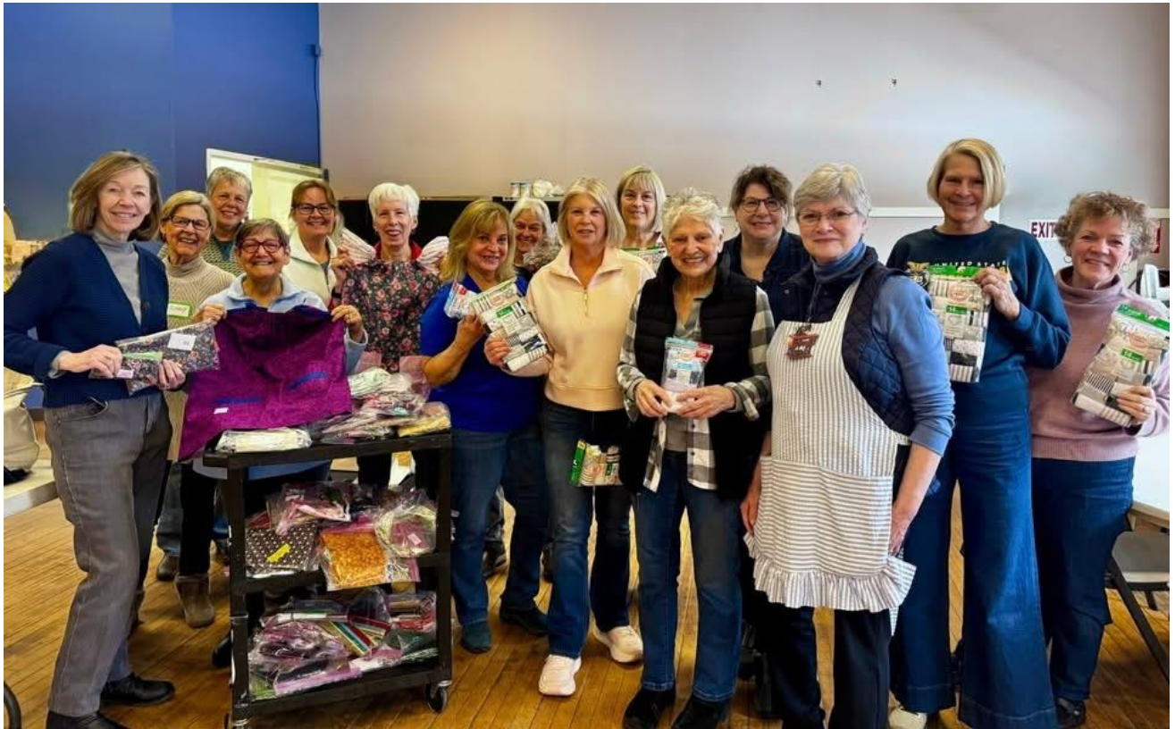
GFWC Dover Area Woman's Club held a successful Dress A Girl Sewing Workshop