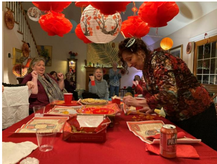
Exeter Area GFWC celebrated Lunar New Year