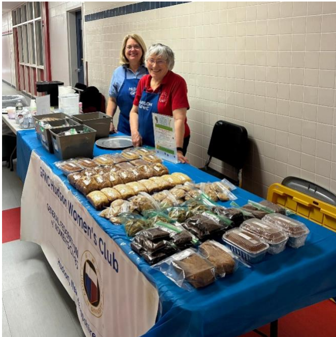
GFWC Hudson Area Woman's Club Bake Sale at Town Voting