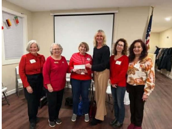
Exeter Area GFWC donated to Room of Love and organization that does room make overs for children