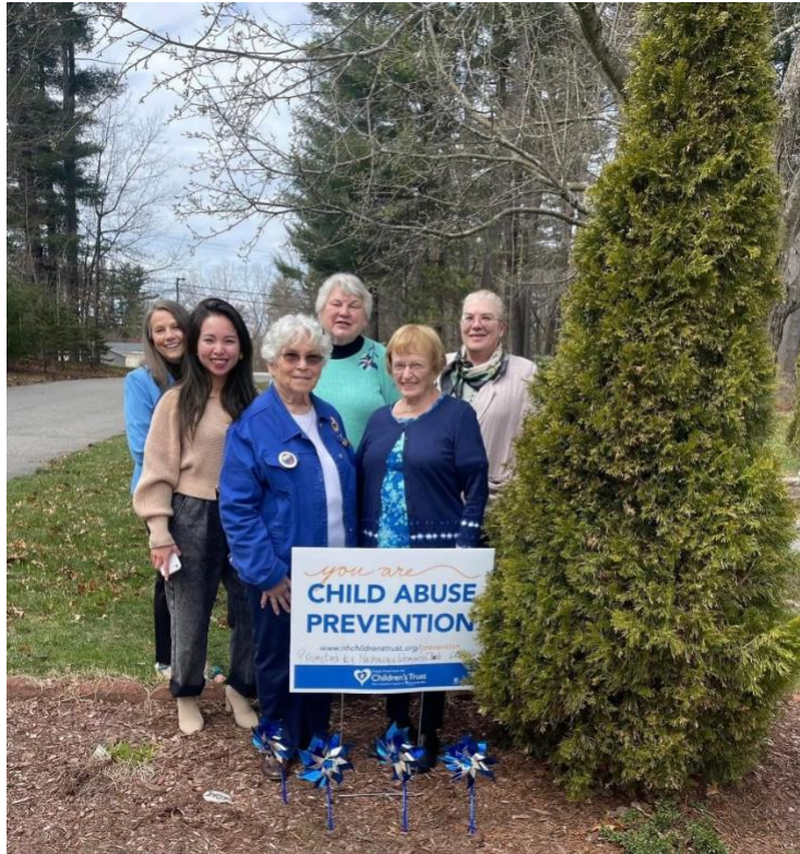
GFWC Nashaway Woman's Club Last year's pinwheel garden